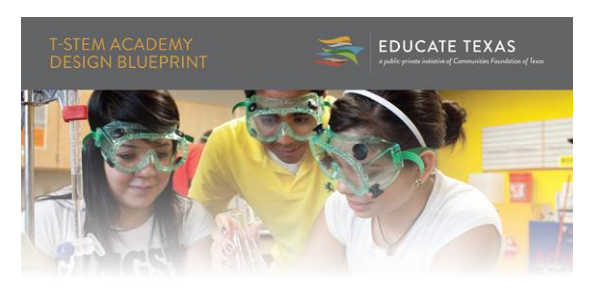
The T-STEM Design Blueprint is a guide to build and sustain STEM schools that incorporates the seven benchmarks of: